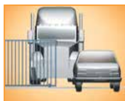
adjustable partial open for different opening distances